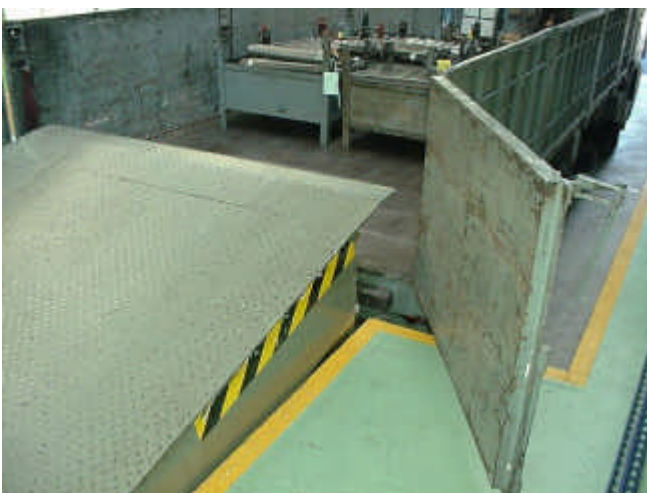
Leveller lowering with lip extended