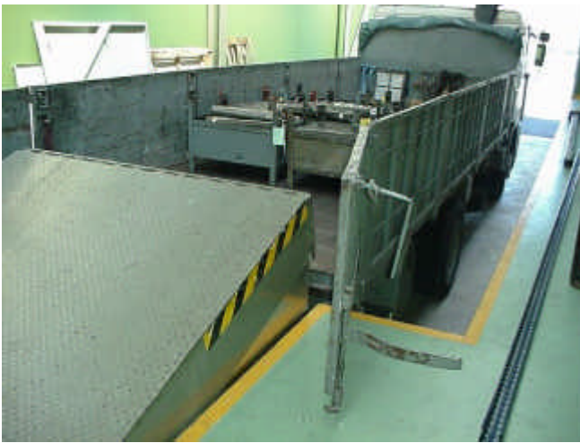
Leveller rising (lip falls automatically)