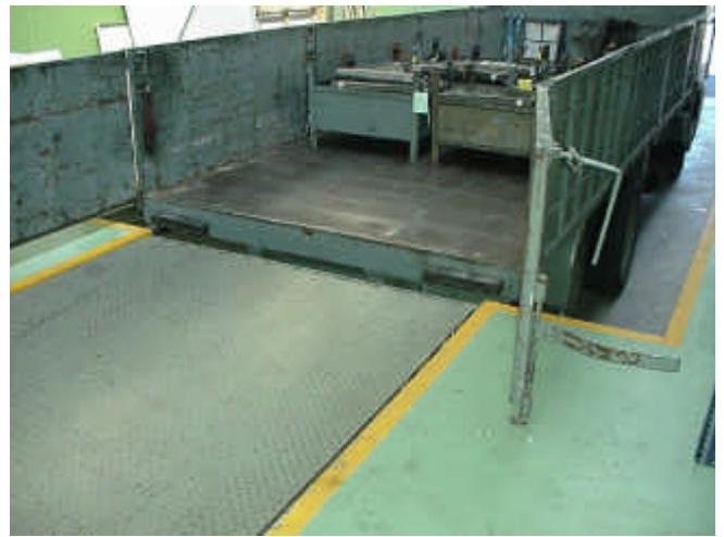
Leveller fully lowered