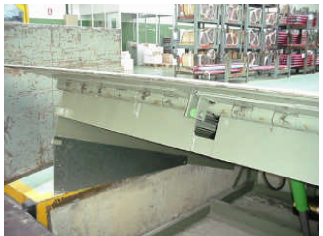
Leveller raised- lip extended