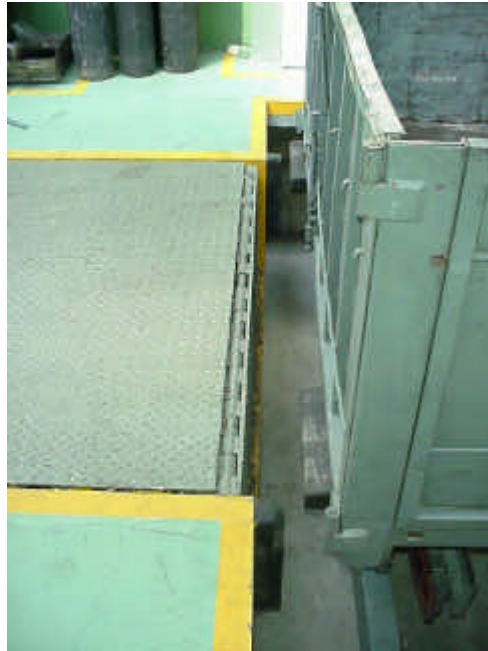
Leveller in rest position - truck arrives