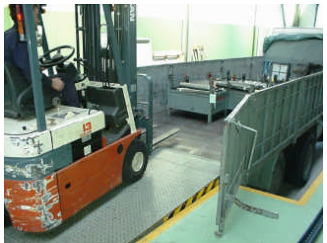
Leveller floating on truck - ready for un-loading by fork-lift truck