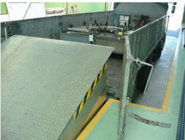
Leveller raised - lip extends automatically