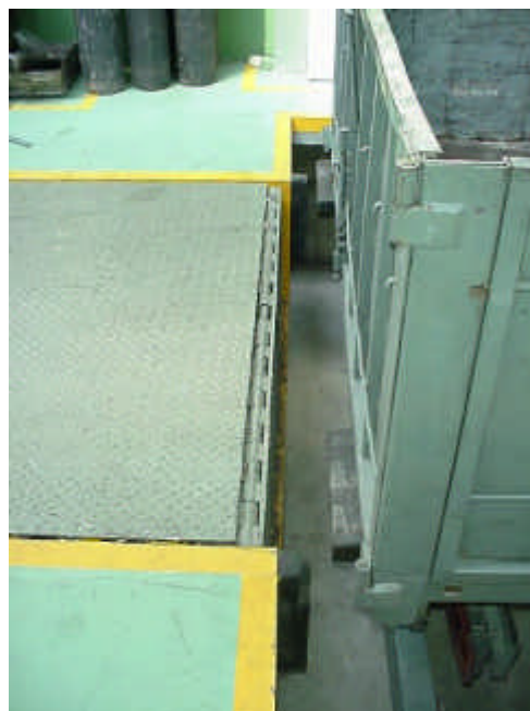
Leveller fully lowered in rest position - lip in "keepers"