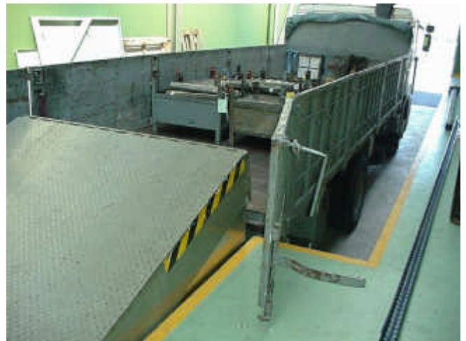
Leveller rising (lip still down)