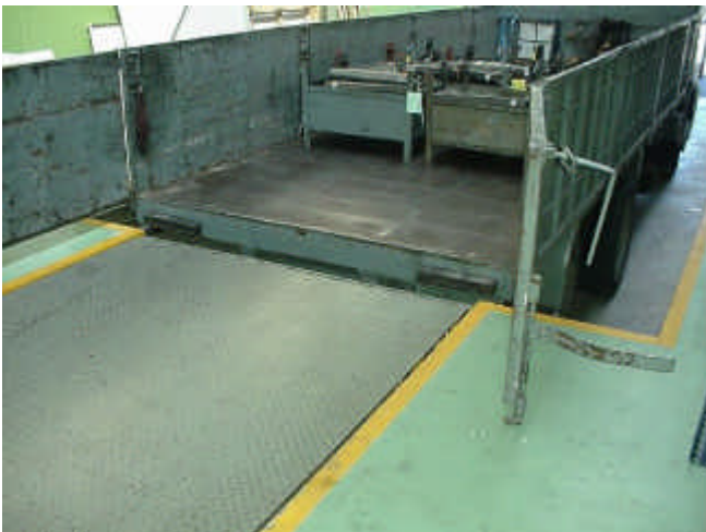
Leveller in rest position - doors open