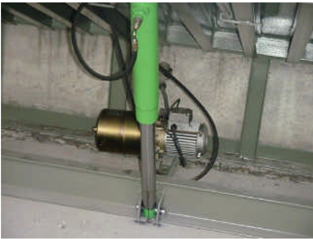
Close-up of extended lift cylinder with power pack behind